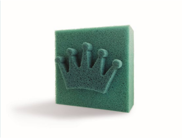
Foam block EvoPoreVHRC