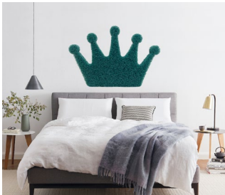
Bed with EvoPoreVHRC crown